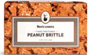
Peanut Brittle Buttery, crunchy and irresistible. 1 lb 8 oz $23.25 #355