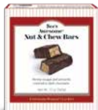
See's Awesome® Nut & Chew Bars Honey nougat, almonds, dark chocolate. 8 bars/12 oz box $13.00 #9633