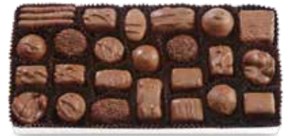
Milk Chocolates Pure milk chocolate goodness. 1 lb $23.50 #326