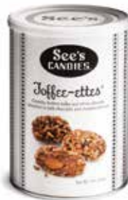
Toffee-ettes® Crunchy toffee, milk chocolate and almonds. 1 lb $23.50 #316