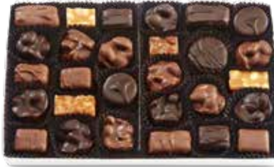
Nuts & Chews Yummy, crunchy and chewy. 1 lb $23.50 #334