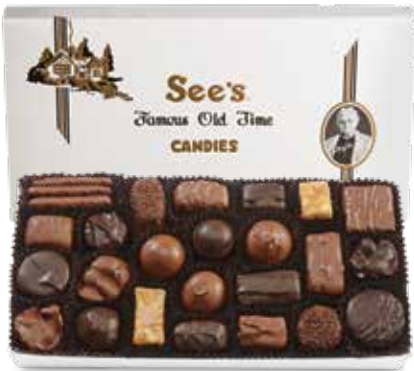
Assorted Chocolates Milk and dark decadence. 1 lb $23.50 #318