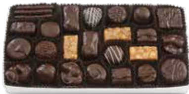
Dark Chocolates A taste of cacao in every bite. 1 lb $23.50 #330