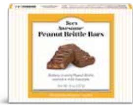
See's Awesome® Peanut Brittle Bars Peanut brittle coated in milk chocolate. 8 bars/8 oz box $13.00 #9634